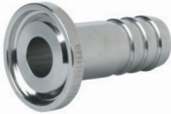
14MPHR - Hosebarb x TC Adapter