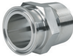
22MP - Female Pipe Thread x TC Adapter